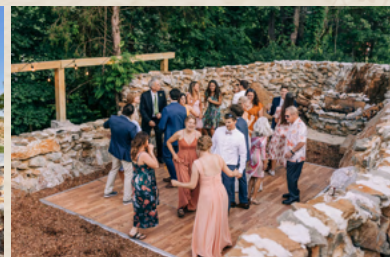
Yeti (Dancing) Cave