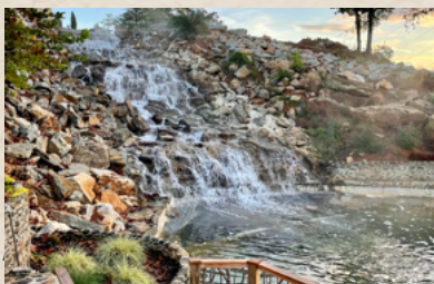
Boyd Hollow Falls

PACKAGE LIMITATIONS The reception is located in a dedicated area, the Willows Landing, for up to 60 guests. This package does not require lodging. A space for the first dance can be provided. Due to sound restrictions, Silent Disco headsets are available for group dancing. Ambiance music is permitted.